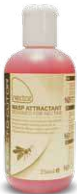
Natural liquid attractant I200